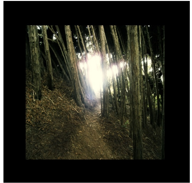
Liza Ryan, It's Only the Light , 2010, Chromatic print